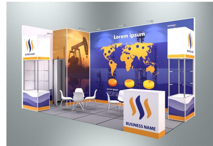
Example of stand with full-color walls design (additional service)