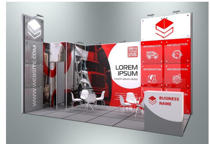
Example of stand with full-color walls design (additional service)