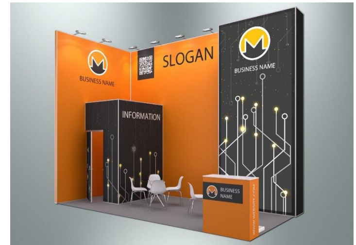
Example of stand with full-color walls design (additional service)