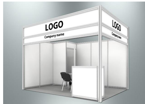
Example of standard stand design

Stand will be located near key exhibitors, what provides best visitor traffic