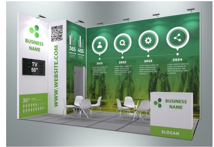
Example of stand with full-color walls design (additional service)