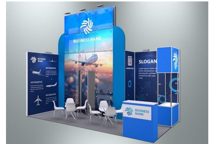
Example of stand with full-color walls design (additional service)