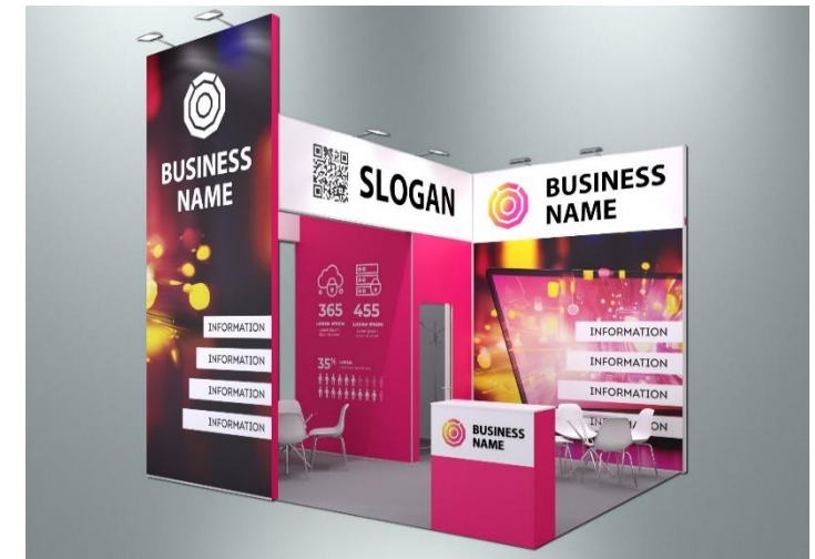
Example of stand with full-color walls design (additional service)