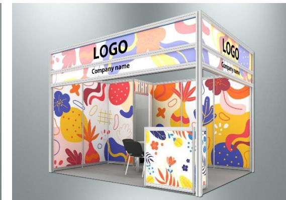
Example of stand with full-color walls design (additional service)